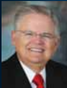
PASTOR JOHN C. HAGEE