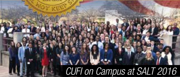
CUFI on Campus at SALT 2016