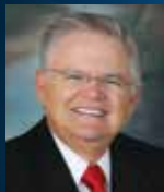
PASTOR JOHN C. HAGEE