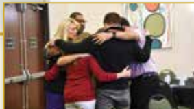
Campus team prayer before SALT begins