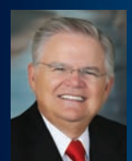
PASTOR JOHN C. HAGEE