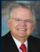
PASTOR JOHN C. HAGEE